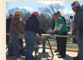
Building with Habitat for Humanity

United Way of Delaware, Inc. University of Delaware U of D Small Business Development Center Urban Promise of Wilmington Wesley College West End Neighborhood House, Inc. West Rehoboth Community Land Trust