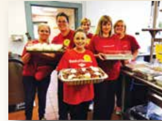
Serving Meals at the Ronald McDonald House

Kent-Sussex Industries, Inc. Kind to Kids Knollwood Community Center La Esperanza La Red Health Center Latin American Community Center Leukemia & Lymphoma Society of DE Light Up the Queen Foundation