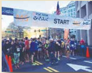
Fighting MS at the Thanksgiving Day Run

Delaware Museum of Natural History Delaware Nature Society, Inc. Delaware Public Policy Institute Delaware Safety Council Delaware Seaside Railroad Club DE Small Business Devel. Resource Centers Delaware Special Olympics Delaware State Chamber of Commerce Delaware State Fair Delaware State Parks Delaware State University Delaware Symphony Association Delaware Tech. & Comm. College Delaware Theatre Company