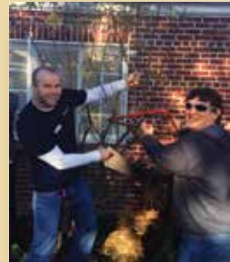
Cleaning Up with Urban Promise

Center for Economic Education and Entrepreneurship Central Baptist Community Devel. Corp. Challenge Program CHILD, Inc. Children and Families First of DE Children's Beach House Chinese American Community Center Christiana Care Foundation Christina Cultural Arts Center Christiana Fire Company City Theatre Company Claymont Community Center Clothing Bank of Delaware Communities in Schools Compassionate Care Hospice Foundation Connections CSP, Inc. Consumer Credit Counseling Services of MD & DE Cornerstone West CDC Cranston Heights Fire Company Delaware Adolescent Program, Inc. Delaware Alliance for Nonprofit Advancement (DANA) Delaware Art Museum Delaware Association for the Blind