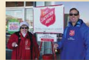
Bell Ringing with the Salvation Army

Opportunity Center Inc. Paws for People People's Place, Inc. Prevent Child Abuse Delaware Primeros Pasos Public Allies Read-Aloud Delaware Reading ASSIST Institute Rehoboth Art League Rehoboth Beach Historical Society Rehoboth Beach Main Street Rehoboth Beach Volunteer Fire Co. Ronald McDonald House Rose Hill Community Center St. Anthony Italian Festival St. Francis Foundation St. Michael's School and Nursery St. Patrick's Center, Inc. Salesianum School The Salvation Army Second Street Players ServiceSource SCORE Delaware SmartDrive Foundation Smyrna Opera House SOAR, Inc. Sojourner's Place Southern DE Therapeutic Riding Supportive Transitional & Emergency Housing Ministry (STEHM) Sunday Breakfast Mission Supporting K.I.D.D.S. Sussex Community Crisis Housing Service Sussex County Senior Services, Inc. Talleyville Fire Company Talleyville Girls Softball Teach for America Toys for Tots Tri-State Bird Rescue & Research United Cerebral Palsy of DE