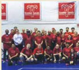
Scoring for Easter Seals at the Volleyball Challenge

Cancer Care Connection Cancer Support Community Delaware Carlisle Fire Company Cathedral Choir School of DE Catholic Charities