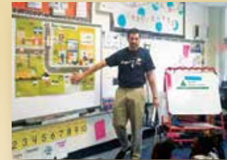
Teaching Kids through Junior Achievement

United Way of Delaware, Inc. University of Delaware U of D Small Business Development Center Urban Promise of Wilmington Wesley College West End Neighborhood House, Inc. West Rehoboth Community Land Trust