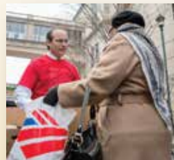
Volunteering with the Food Bank of Delaware

Delaware Vol. Firefighters Assoc. Delaware Wild Lands Delaware Youth for Christ Diamond State Community Land Trust Dover Fire Department Dover Interfaith Mission for Housing Dover Little League Down Syndrome Association of Delaware Downtown Milford, Inc. Downtown Visions Duffy's Hope Easter Seals Society Eastside Community Learning Center Emerging Enterprise Center Emmanuel Dining Room Epilepsy Foundation of Delaware Exceptional Care for Children Faithful Friends Family Promise of Northern New Castle Co. First State Community Action Agency First State Community Loan Fund First State Innovation First Steps Primeros Pasos First Tee of Delaware Food Bank of Delaware Forum to Advance Minorities in Engineering, Inc. Fresh Start Scholarship Foundation Friends of Milford Aquarium