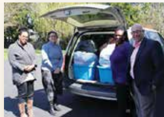
Replenishing the Cupboard for Family Promise

Delaware Breast Cancer Coalition Delaware Business Roundtable Delaware Center for Horticulture Delaware Center for the Contemporary Arts Delaware Children's Museum Delaware Children's Theater DE Coalition Against Domestic Violence Delaware College of Art & Design DE Community Development Corp. Delaware Community Foundation Delaware Community Investment Corp. Delaware Community Reinvestment Action Council, Inc. (DCRAC) Delaware Federation of Housing Counselors Delaware Financial Education Alliance Delaware Financial Literacy Institute Delaware Foundation for Retarded Children Delaware Futures, Inc. Delaware Grantmakers Association Delaware Guidance Services Delaware Historical Society Delaware Hospice Delaware Housing Coalition Delaware Humane Association Delaware KIDS Fund