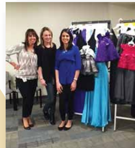
Helping Cancer Survivors to "A Prom to Remember"

Friends of Wilmington Parks Friends of Woodlawn Library Friendship House, Inc. Georgetown-Millsboro Rotary Club Girls, Inc. Girls on the Run Delaware Girl Scouts Goldey-Beacom College Goodwill Industries Grand Opera House Habitat for Humanity Hagley Museum & Library Harvest Community Development Corp. Healthy Food for Healthy Kids Henrietta Johnson Medical Center Hilltop Lutheran Neighborhood Center Historical Society of Delaware Historic Red Clay Valley, Inc. Hockessin Community Center Homeless Planning Council of Delaware