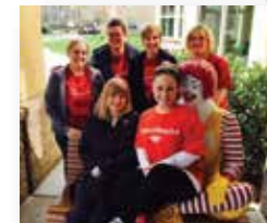
Helping at Ronald McDonald House

Nanticoke Senior Center Nanticoke Young Life National Alliance on Mental Illness DE National Council on Agricultural Life & Labor Research Fund, Inc. (NCALL) Nehemiah Gateway CDC Neighborhood House, Inc. Nemours Fund for Children's Health Newark Rotary Foundation Newark Senior Center New Castle Co. Chamber of Commerce Opera Delaware Operation SEAs the Day Operation Warm Paws for People People's Place, Inc. Police Athletic League Produce For Better Health Foundation Project New Start Public Allies Quaker Hill Historic Preservation Foundation Read-Aloud Delaware Reading ASSIST Institute Rehoboth Art League Rehoboth Beach Historical Society Rehoboth Beach Main Street Rehoboth Beach Volunteer Fire Co. Ronald McDonald House St. Anthony Italian Festival St. Michael's School and Nursery St. Patrick's Center, Inc. Salesianum School The Salvation Army ServiceSource SmartDrive Foundation SOAR, Inc. Sojourner's Place Southern DE Therapeutic Riding Summer Learning Collaborative Sunday Breakfast Mission