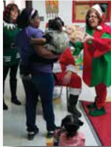
Celebrating with the Ministry of Caring

Cancer Support Community Delaware Cape Community Fund Carlisle Fire Company