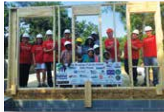
Building Strong Communities with Habitat for Humanity

Delaware Seaside Railroad Club Delaware Shakespeare Festival Delaware Small Business Development Resource Centers Delaware SPCA Delaware Special Olympics Delaware State Chamber of Commerce Delaware State Fair Delaware State University Delaware Symphony Association Delaware Tech. & Comm. College Delaware Theatre Company Delaware Vol. Firefighters Assoc. Delaware Wild Lands Delaware Zoological Society Inc Delmarva Teen Challenge Diamond State Community Land Trust Disabled American Veterans Dover Fire Department Dover Interfaith Mission for Housing Dover Little League Downtown Milford, Inc. Downtown Visions Ducks Unlimited Easter Seals Society Eastside Charter School Eleutherian Mills-Hagley Foundation Inc Emerging Enterprise Center Emmanuel Dining Room Delaware Humane Association Everett Theater Exceptional Care for Children Faithful Friends Family Promise of Northern New Castle Co. First Book First State Community Action Agency First State Community Loan Fund First State Innovation