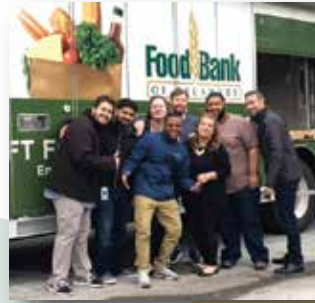
Restocking the Food Bank's Mobile Food Pantry

Delaware Adolescent Program, Inc. DE Alliance for Nonprofit Advancement (DANA) Delaware Art Museum Delaware Breast Cancer Coalition Delaware Business Roundtable Delaware Center for Homeless Veterans Delaware Center for Horticulture Delaware Center for the Contemporary Arts Delaware Center for the Inland Bays Delaware Children's Museum Delaware Children's Theater DE Coalition Against Domestic Violence Delaware College of Art & Design DE Community Development Corp. Delaware Community Foundation Delaware Community Investment Corp. Delaware Community Legal Aid Society Delaware Community Reinvestment Action Council, Inc. (DCRAC) Delaware Disabled American Veterans Delaware Federation of Housing Counselors Delaware Financial Education Alliance Delaware Financial Literacy Institute Delaware Foundation for Retarded Children Delaware Futures, Inc.