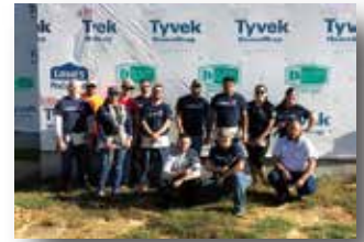
Volunteering with Milford Housing Development

Supporting K.I.D.S. Sussex Community Crisis Housing Service Sussex County Senior Services, Inc. Talleyville Fire Company Teach for America TeenSHARP Toys for Tots Tri-State Bird Rescue & Research United Cerebral Palsy of DE