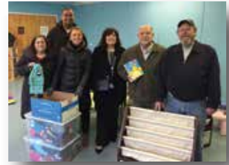
Holding a Hat and Mitten Drive at the Latin American Community Center

Supporting K.I.D.S. Sussex Community Crisis Housing Service Sussex County Senior Services, Inc. Talleyville Fire Company Teach for America TeenSHARP Toys for Tots Tri-State Bird Rescue & Research United Cerebral Palsy of DE