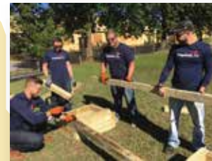
Building Playgrounds for the Boys and Girls Club

First State Robotics First Steps Primeros Pasos First Tee of Delaware Food Bank of Delaware Forum to Advance Minorities in Engineering, Inc. 4-H Clubs of Delaware Frederica Senior Center Fresh Start Scholarship Foundation Friends of Milford Aquarium Friends of Wilmington Parks Friendship House, Inc. Girls, Inc. Girls on the Run Delaware Girl Scouts Goldey-Beacom College Goodwill Industries Grand Opera House Greater Dover Foundation Habitat for Humanity